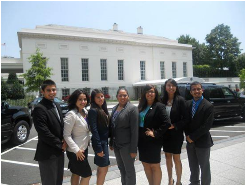
Picture on the East Side of the White House.