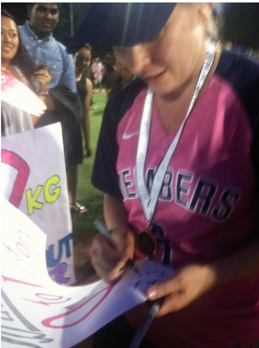
Senator Gillibrand signs our posters. 😊