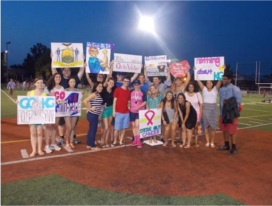
Senator Gillibrand, interns, and I after the softball game!