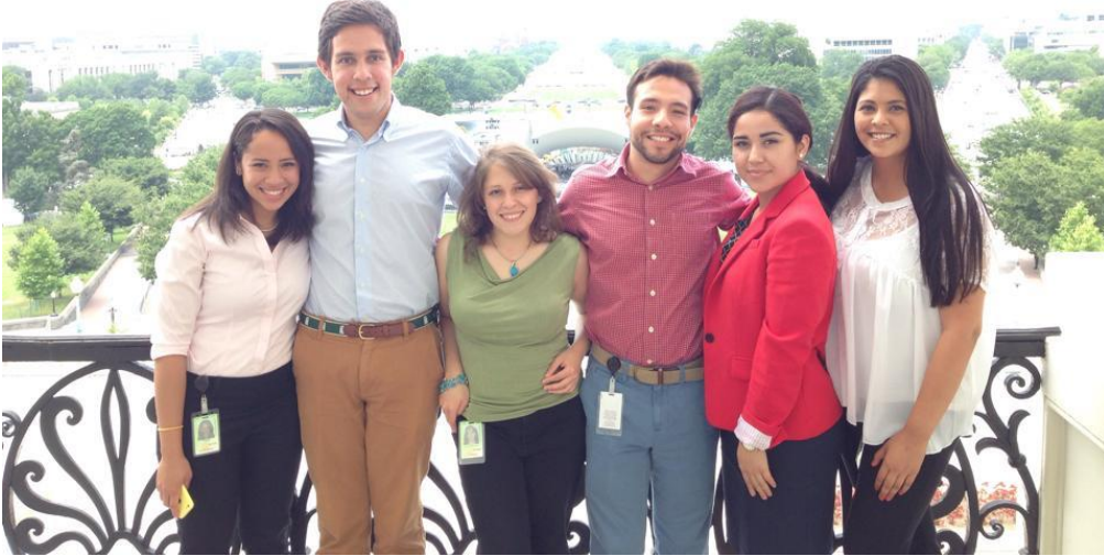
At the Speakers Balcony! Incredible view.