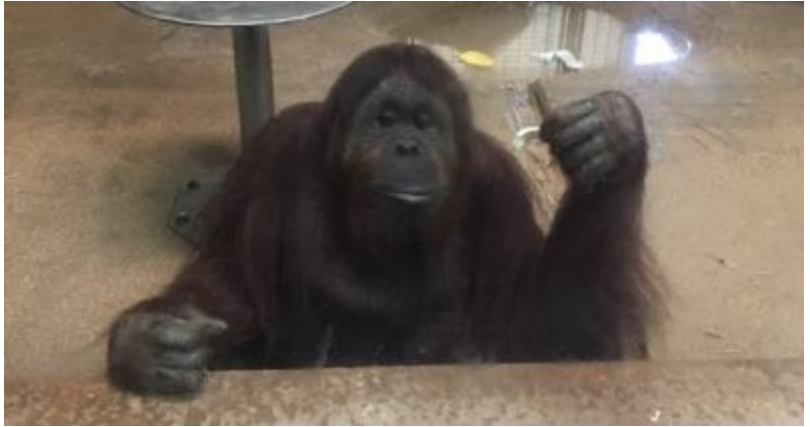
Sunday, we went to the Zoo!