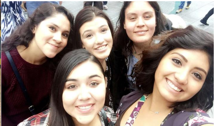
Without my friends this trip would not have been the same!