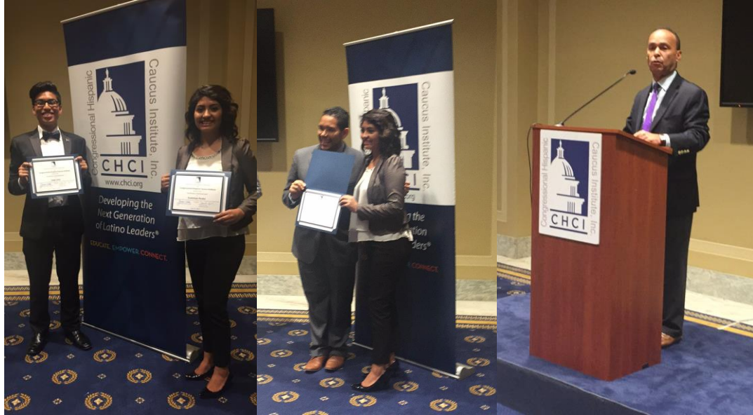
I am a Congressional Hispanic Caucus Institute alumna!

This week, I had the honor of becoming a Congressional Hispanic Caucus Institute alumna. My week only got better because my friend from MSU came to visit me. This was my friend's first time in Washington D.C. and I wanted to show him all of the fascinating monuments and the beautiful city attractions. Before beginning our tour, we decided to go to dinner. I wanted to try something new so we agreed to go to the Founding Farmers Restaurant. Their food was delicious. I had cornbread which contained real pieces of corn. That was the best part because it reminded me of my mother's baking. After dinner, we were so full that we did not want to walk anywhere, so we decided to Uber there. I never realized how far apart the monuments were from one another until we started walking. The walk was worth it.