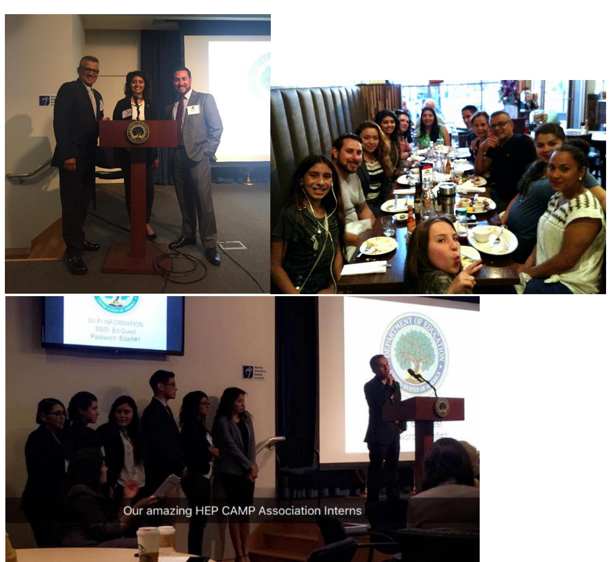
Seven interns making a difference!

Since I spent most of my week at the Department of Education, Thursday became my last day as an intern at the Senate office. I was provided an opportunity to attend a Dome Tour that was incredible and a bit scary because I am afraid of heights. When we arrived at the top of the Capitol Building, I could not believe what my eyes could see. My view was the most beautiful. I became speechless because I was able to see all of Washington D.C. and there was not a better way to say my farewell to this incredible city. Saying goodbye to the interns and to my supervisor was more difficult than I thought. I did not want this experience to end. I have attained so much knowledge from working at the office. I learned how the functions of legislation, the importance of a constituent's voice, and the value of my role as an intern at Capitol Hill.