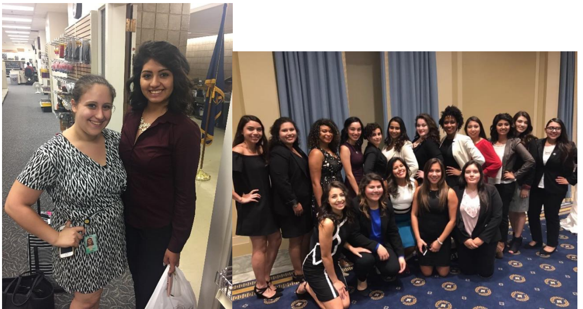
Interns who will become future leaders of America!

It is hard to believe that my internship in Washington D.C. has come to an end. I have explored and learned so much. From eating flowers, to the fascinating monuments, and experiencing the functions of a Senator's office. Washington D.C. challenged me to step out of my comfort zone. I had to learn to be proactive to make the most towards developing my networking through all of the great people that I was able to meet. I met wonderful individuals that have now become great friends and family. I know these friendships will last because of the common interests that we discovered that we share, including strong motivation and determination to reach our American Dream.