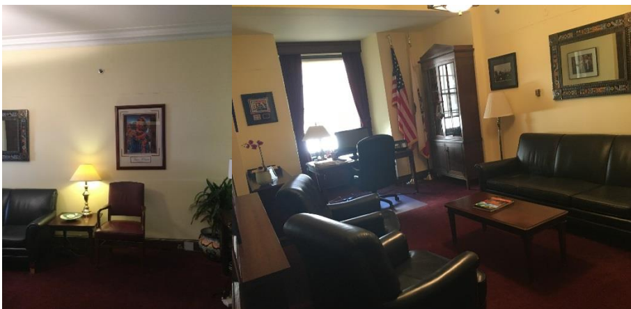
Rep Becerra's Office

Monday May 30, 2016: On Monday morning we woke up early to go to the Arlington National Cemetery to see the Tomb of the Unknown Soldier. On our way, we found out that President Obama would be there so we rushed to get there. Unfortunately, when we arrived the area was on lockdown because the President had already arrived, and we were unable to see him. Although all of Arlington National Cemetery is an amazing place, we went to the Tomb of the Unknown Soldier, the John F. Kennedy Gravesite, and the Arlington House. It was just so breathtaking to realize that all of the fallen soldiers there had sacrificed their lives for our freedom. My favorite part of Arlington Cemetery was the Tomb of the Unknown Soldier; it was just so beautiful how the guards respected those fallen soldiers and their families as well. After a long day we all went back to prepare dinner, that night we made lasagna, it tasted delicious! I also prepared myself mentally for my first day of work.