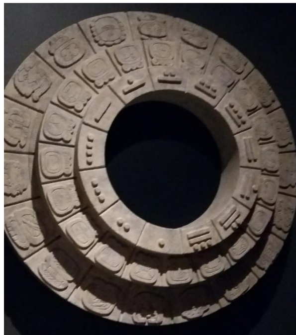
The Mayan calendar

becoming a leader that will come back to my community and give back what I have had the privilege to learn and see.