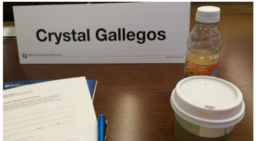
OCC welcomes all interns with neat name plates.