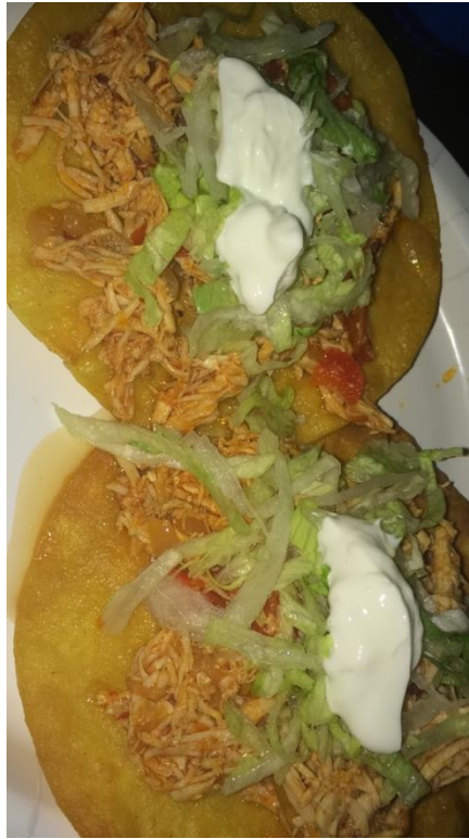
Tinga for dinner!!!