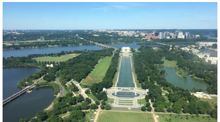
Just in case you were wondering what the view is like from the top of the Washington Monument