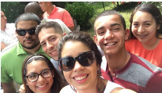
Snapping some quick photos at the Barbeque