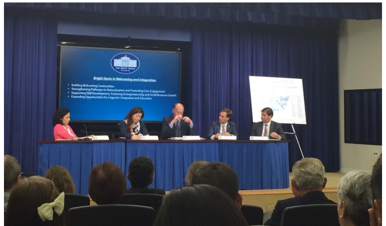
The White House Program for New Americans Event