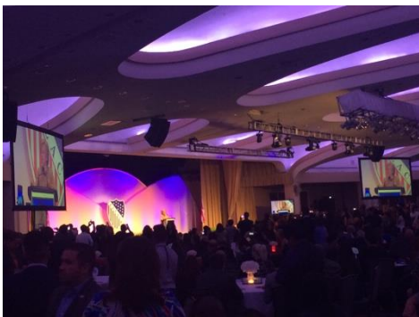
Secretary Clinton Speaking at the LULAC Unity Luncheon

This experience in the internship at the Office of Migrant Education and with the Congressional Hispanic Caucus Institute is one that I will treasure forever. I did not imagine me changing and growing so much as an aspiring professional and as a leader. I feel blessed to have had this opportunity. I am very thankful to the National HEP/CAMP Association for this and I would also like to thank all of the people who work for HEP and CAMP to help my peers and me.